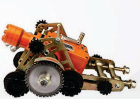
The 4th generation