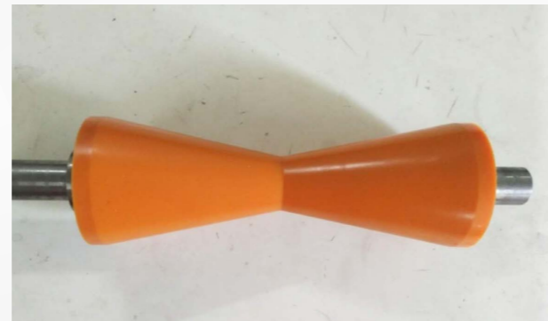
Steel Roller with PU